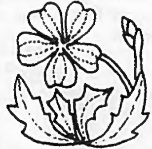
Trailing Goodenia Goodenia lanata (Club Logo)